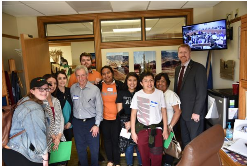
CAUSA members and constituents.

Student leaders from Redmond and North Wasco advocating on the important work of Joint Interim Committee On Student Success.